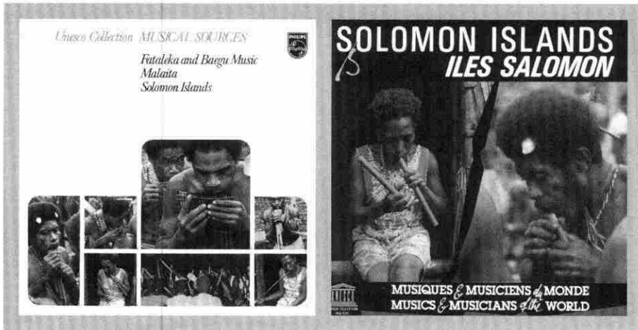
Figures 4 and 5 Rorogwela's ethnomusicological aura