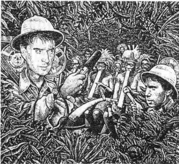
On a search for new musical inspiration, David Byrne unexpectedly runs into Paul Simon.

Into and through the 1990s, pop star curation continued to lead the marketplace expansion of world music. But in each case distinct models of the inspiration and collaboration mix also emerged, revealing more of the political and aes-