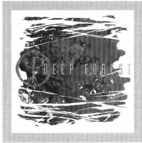
Figure 3 The “maybe . . . your future” of primitive and spiritual modernism

The second reference here is to Simha Arom, another CNRS ethnomusicologist, whose recordings of Central African pygmy music are sampled on many of Deep Forest 's tracks. In fact much of the music on Deep Forest involves pygmy references, and the theme of the African rain forest and its peoples is announced strongly in the CD's music and packaging. Indeed, the introductory song, also titled “Deep Forest,” begins with a very deep and resonant voice that announces (in English): “Somewhere deep in the jungle are living some little men and women. They are your past. Maybe they are your future.”